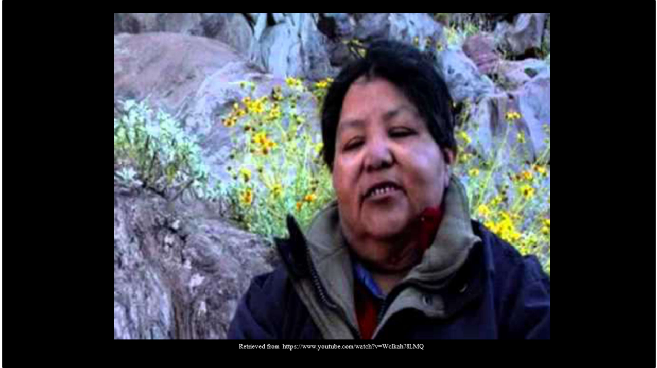
A brief history of the Havasupai as told by a tribal member. Retrieved from https://www.youtube.com/watch?v=WcIkah78LMQ